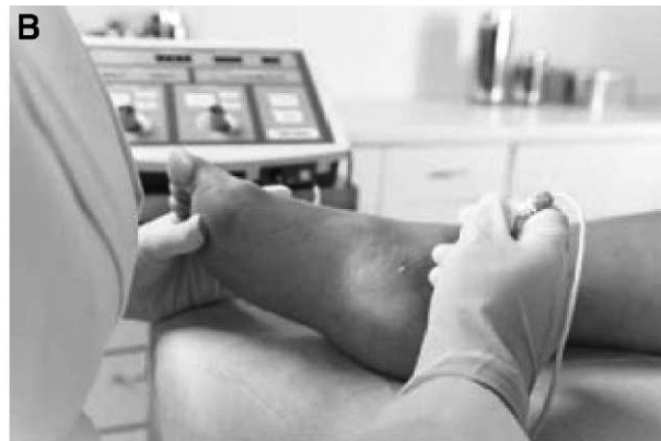
Figure 1. A, The NT250 radio-frequency device (NeuroTherm, Wilmington, Massachusetts). B, The probe being inserted into the heel.

identical in the treatment and sham groups as well. Because a local anesthetic agent is injected before nerve ablation, neither treatment group nor sham group participants could feel the nerve ablation process.